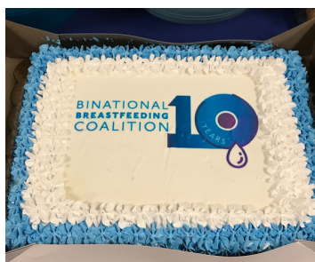
BBC 10 year Anniversary El Paso