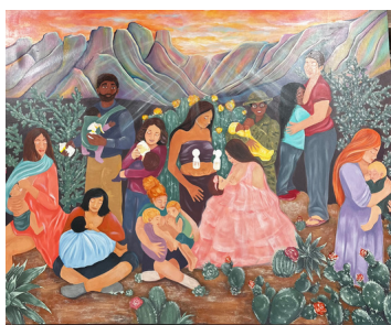
Las Cruces Chapter Mural Las Cruces

We celebrated an exciting NBM/WBW in 2022 across the state with special events and celebrations.