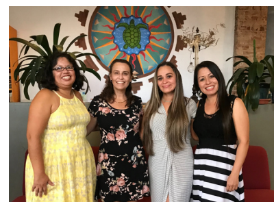
Lactation Art Opening Albuquerque